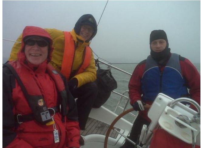
BCC Class "Toughing it Out"