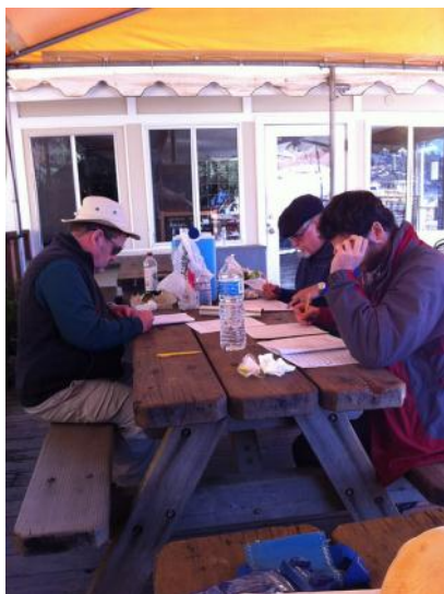
BCC Course Testing at Angel Island

Aloof : Yes, this has a nautical origin. In sailing, it originally meant keeping your luff as close to the wind as possible— a-luff —and in particular, was used when falling off the wind may have put you on a lee shore.