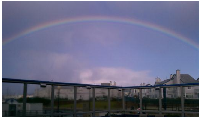
The up-side of a drizzly morning at TWSC!