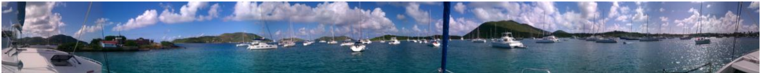
Almost-360-degree panorama of the anchorage & mooring field at Trellis Bay, Beef Island, B.V.I.

Feb 26 9am- 5pm Advanced Docking & Motoring - Take the stress out of close-quarters maneuvering & boat handling. Let us show you all of the tricks for docking in tough conditions and looking good in not-so-tough conditions! Upwind, Downwind, Forwards, Backwards, it's all possible and it doesn't have to be stressful! This course is a pre-requisite for checking out on our largest boats, over 35'. Includes ASA 118 Certification (Docking Endorsement) $225/person