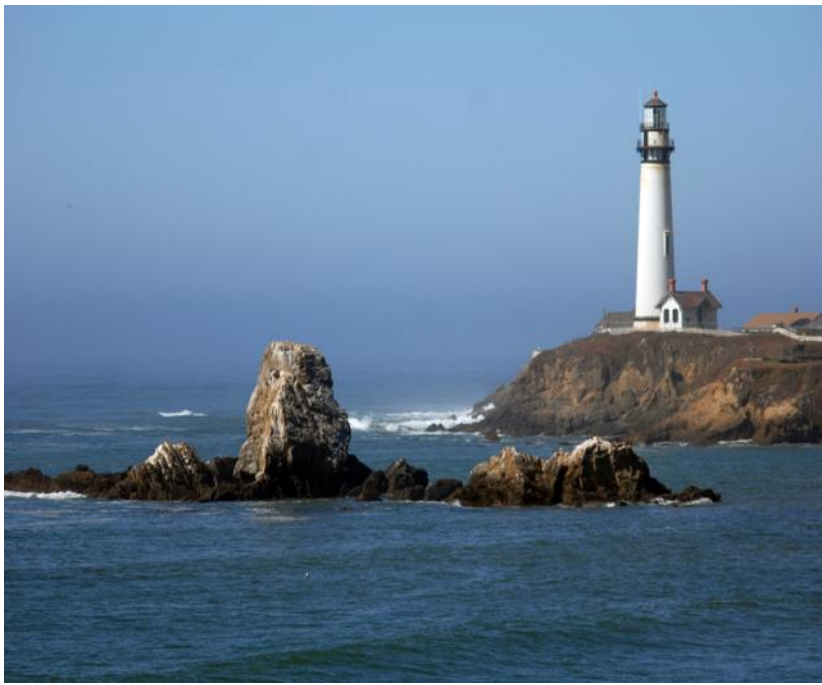
Rounding Point St. Vincent Light, Palace Verdes