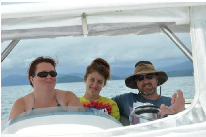
These are our vacation faces!